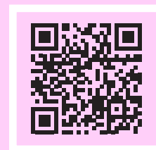
SPRING GALA HUB 2026

QUESTIONS? Email us at info@gasperschoolofdance.com