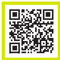
SPRING DANCE GALA HUB