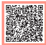
DRESS REHEARSAL SCHEDULE