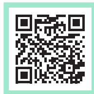
BEST OF TIMES PHOTOGRAPHY